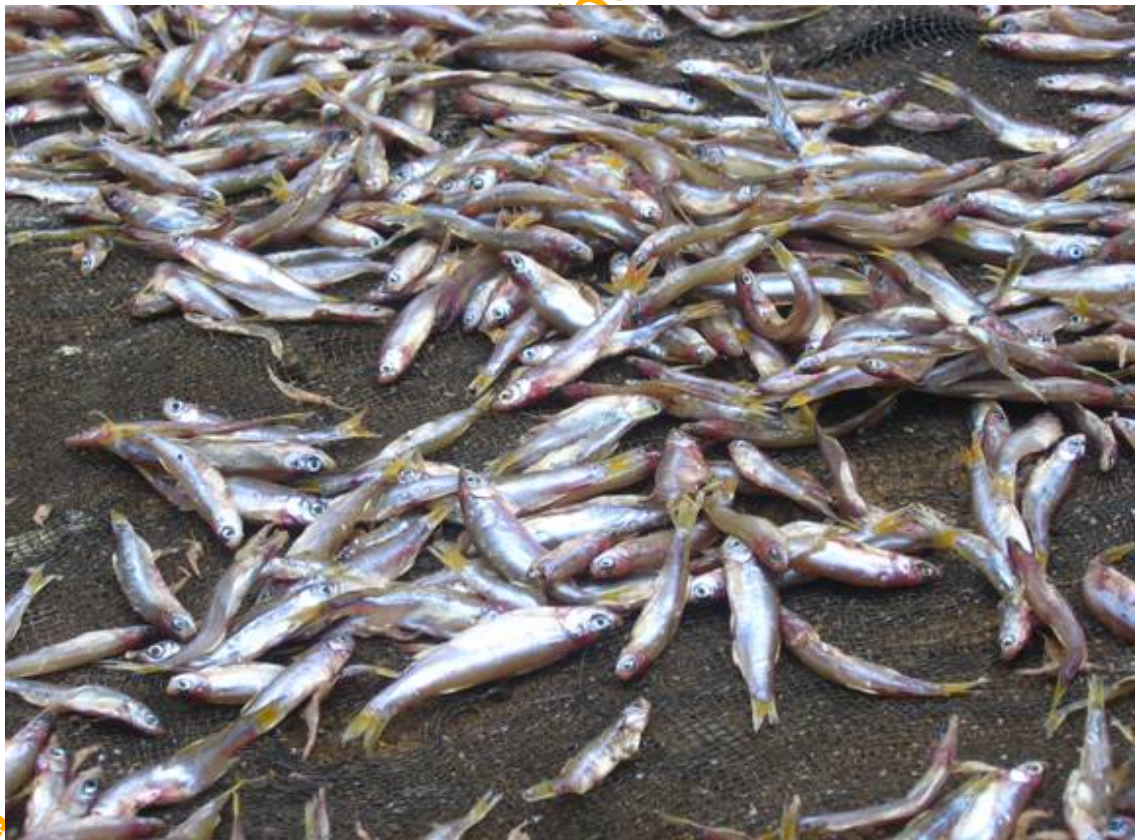
Omena being dried