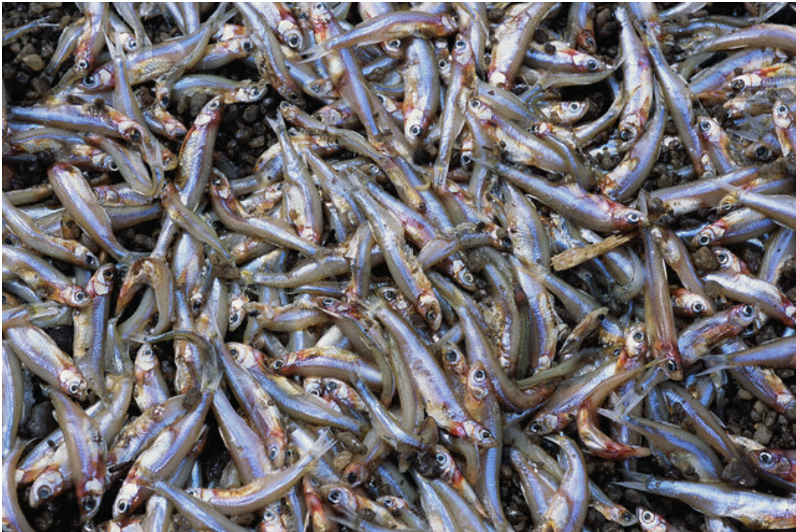
Omena being dried