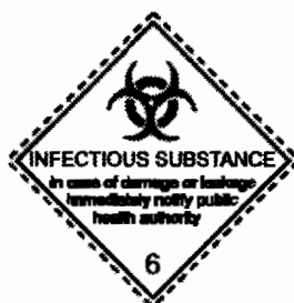
Figure 3 — Infectious hazard label

6.2.8 All packaging shall be clearly labelled and marked with the infectious hazard label (see figure 3), where possible. If a plastics bag is placed into another container the outer container shall be clearly labelled.