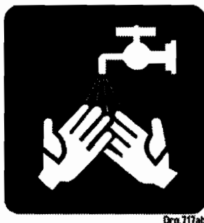
Figure 1 — Work instruction in the form of a drawing

4.4.2 The work procedures and work instructions shall cover at least the following: