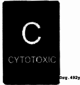
Figure 6 — Cytotoxic hazard label

6.4.4.2 Cytotoxic waste can be generated from several sources that include the following: