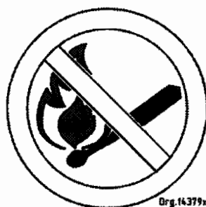
Figure 2(a) — Fire and open flames prohibited