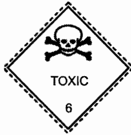
Figure 4 — Hazard label for toxic substances

6.4.3.2 The containers shall be clearly marked " PHARMACEUTICAL WASTE – LIQUID ", be colour-coded dark green (see table 1) and shall bear the international hazard label for toxic substances (see figure 4) of division 6.1, where possible.