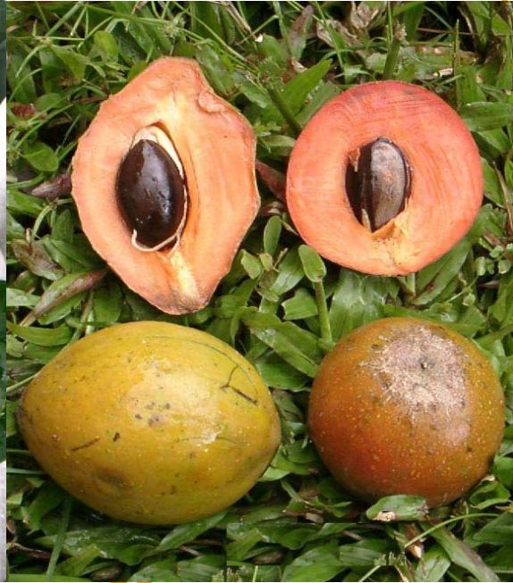
Green sapote types