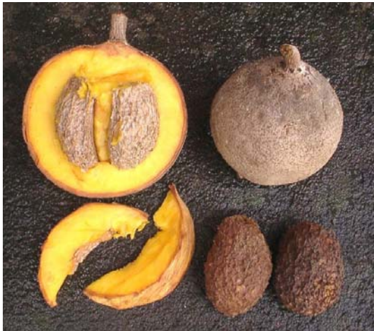
Mammee apple, Mamey (very large seeds)