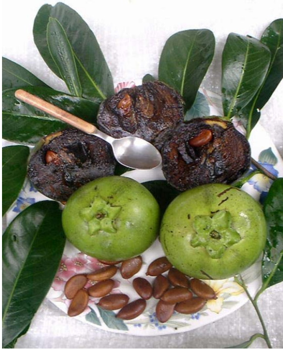
Chocolate or black sapote