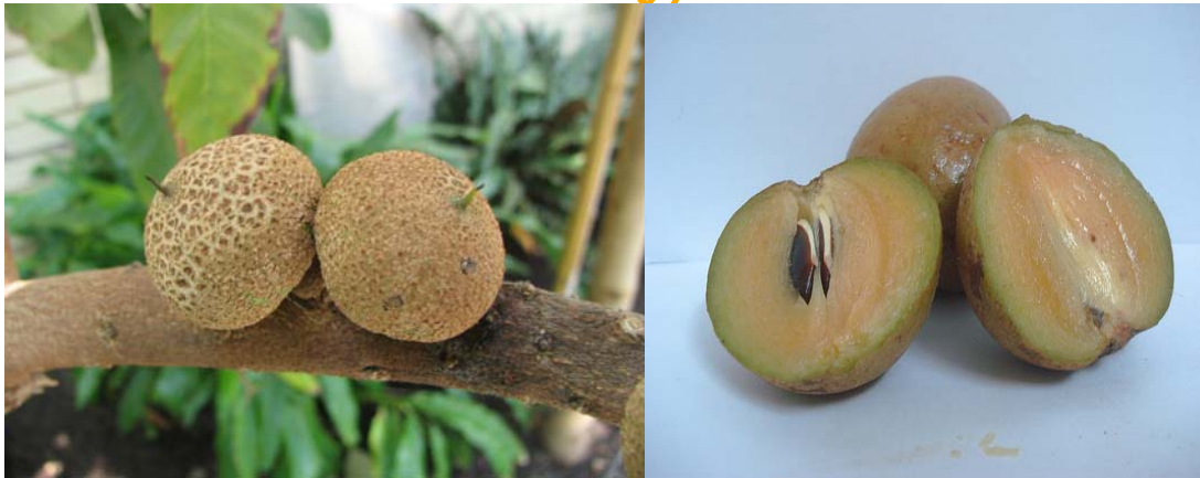
Pouteria sapota (Sapote, marmalade)

10.2 The produce should comply with any microbiological criteria established in accordance with CAC/GL 21.