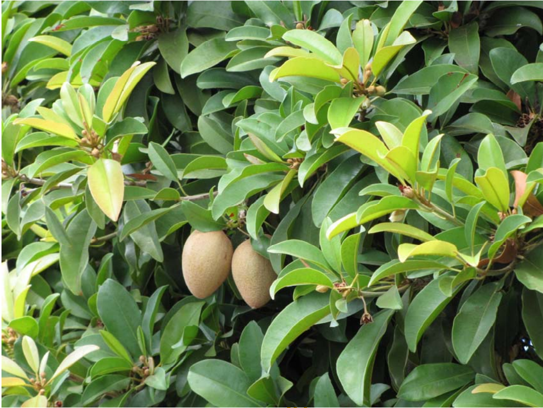
Mamey Sapote Tree