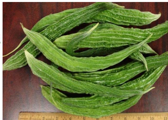
Karela or bitter melon