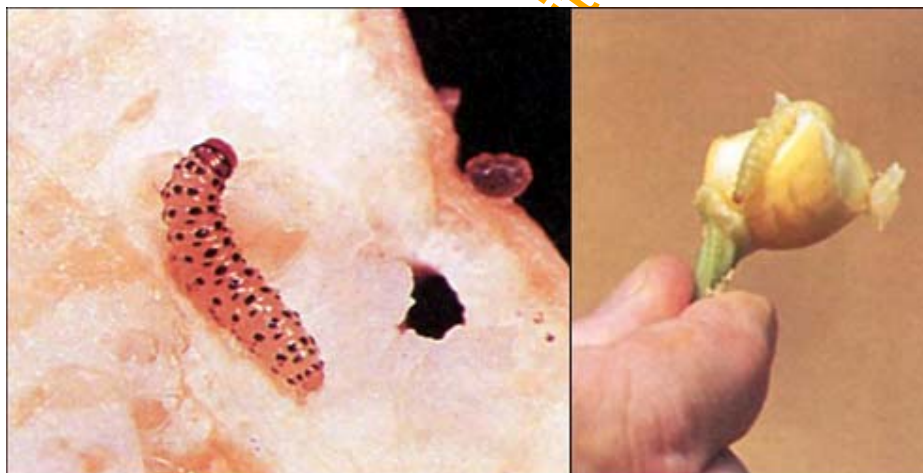
Figure B.7 — Pickleworm, young larva (left); pickleworm, mature larva (right)

The pickleworm, Diaphania nitidalis , and melonworm, D. hyalinata are migratory insects. Pumpkins are more preferred than gourd. Pickleworms bore and tunnel into the fruit and are more serious than the melonworm which feeds mainly on the foliage. Preventive sprays should be made if they are observed in the field or infestations are known to be in the other production areas. (Figure B.7)