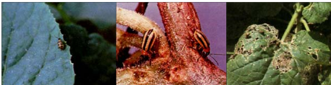
Figure B.3 — From left: spotted cucumber beetle, striped cucumber beetle and stem damage, cucumber beetles and foliage damage