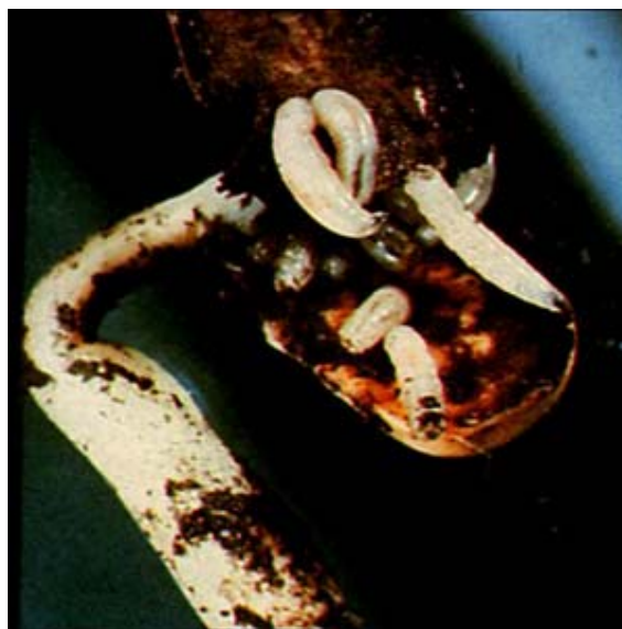
Figure B.1 — Root maggots

Several practices may be used to help control maggots. Previous crop litter and weeds should be turned deeply several weeks prior to planting so there is adequate time for decomposing. Plant during optimum conditions for rapid germination and seedling growth. Early plantings should be preceded by incorporation of a recommended soil insecticide. Plants should be maintained stress free until they are beyond the seedling stage. (Figure B.1)