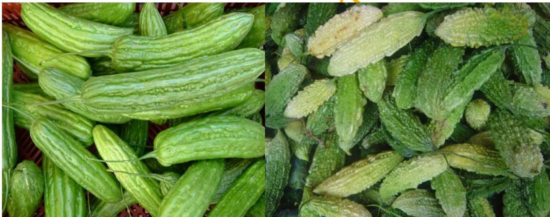
Fresh karela — Bitter melon