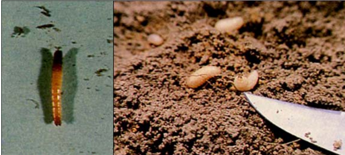
Figure B.2 — Wireworm (left), whitefringed beetle larvae (right)