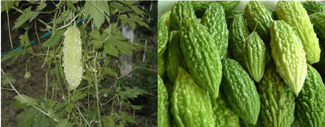
Fresh karela — Bitter melon