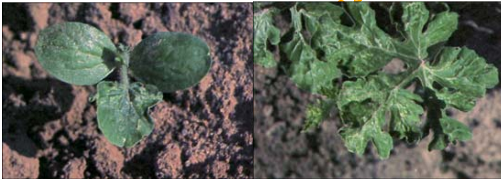
Figure B.5 — Thrips damage, seedling (left); thrips damage, mature leaf (right)

Thrips can be controlled with foliar insecticide applications. There are no treatment thresholds developed for thrips. As a rule-of-thumb, treatments are not generally necessary if thrips are damaging only the foliage. Treatments for thrips during early fruit development may be initiated when a majority of the blooms are found infested with large numbers of thrips, 75 or more per bloom, however, treatments are rarely justified. (Figure B.5)