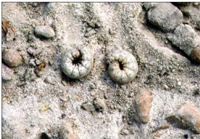
Figure B.6 — Cutworms