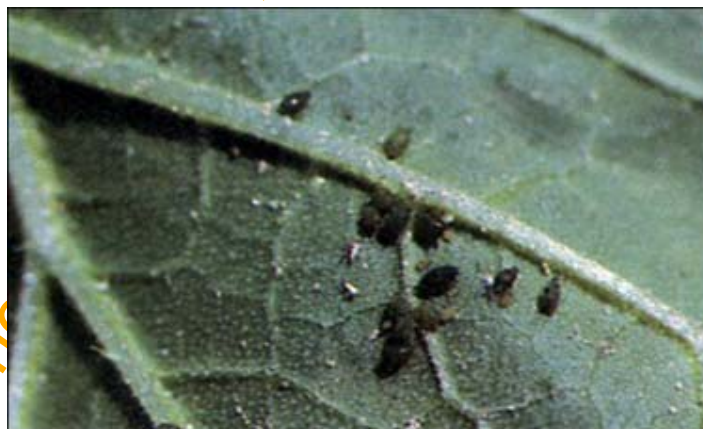
Figure 4 — Colony of aphids

Several insecticides are effective on light to moderate populations of aphids. If winged aphids are easily found (10 percent of plants infested), treatment is warranted. Thorough coverage is essential since aphids live on the underside of leaves. (Figure B.4)