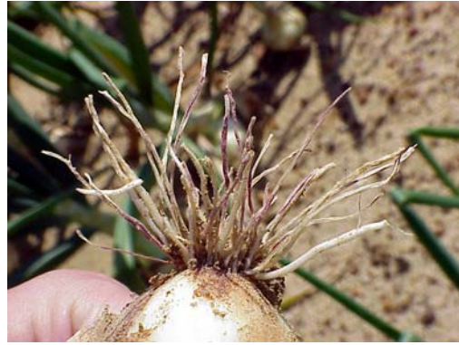
Figure B.6 — Pink colored roots of onions infected with pink root ( Phoma terrestris )

Management Options: Using a long rotation to non-related crops (3-7 years) is the key management strategy for reducing losses to pink root. Correct soil tilth, fertility and water management will reduce stresses that enhance disease development. The optimum temperature for growth and infection by pink root is 79 degrees F, so delaying planting until soil temperatures average 75 degrees F or below will allow onions infected with pink root to grow and develop prior to temperatures that enhance infection. Harvesting onions prior to soil temperatures reaching 79 degrees F allows onions to escape further pink root infection. Fumigation with metam sodium, chloropicrin and 1,3-D dichloropropene (Telone) is shown to increase yields when onions have been planted to fields heavily infested with pink root. Consider onion varieties resistant to pink root and have horticulturally acceptable qualities. Research is continuing to evaluate fumigants on onion performance.