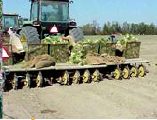
Figure B.3 — Pegger

Harvest maturity is reached when 20-50 percent of the onion tops are down. In most seasons, onion neck tissue breaks down when the plant is mature. Although this is a good rule-of-thumb for determining when onions mature, the tops may not go down as readily in some years or for some varieties. In addition, early varieties are very day length sensitive and usually go down early and uniformly. Harvest these early varieties when 100 percent of the tops go down. They can be allowed to stay in the field for a week after tops go down and will continue to enlarge. This will increase the yield as the bulbs continue to increase in size. Knowing the variety and carefully inspecting the crop is the best method to determine maturity. Whether the tops go down or not, the neck tissue will become soft, pliable, and weak at maturity. Onions harvested too early may be soft and not dry down sufficiently during curing. In addition, they may begin to grow because they are not completely dormant. If the onions are harvested too late, there may be an increase in post-harvest diseases and sun-scald on the shoulder of the bulb. Although hybrids will have a narrow window of maturity, they will not all mature at once. Generally, a field of onions will be harvested before all the bulbs have their tops down.