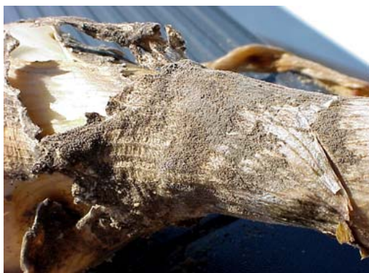
Figure 8. Gray sporulation of Botrytis

Symptoms: Although the bulk of losses to Botrytis neck rot are in storage, severe losses can be experienced in field situations. Plants infected in the field exhibit leaf distortion, stunted growth, and splitting of leaves around the neck area. A grayish sporulation of the fungus may be observed between leaf scales near the neck area (Figure B.8). In storage, infection can be internal with no discernable symptoms on the onion. It is not until onions are removed from storage that the infection becomes evident. Apparently, the infection enters the neck and continues to grow undetected in storage until the onions are removed. It has been demonstrated that Botrytis neck rot is not capable of sporulation in controlled atmosphere storage (high CO 2 , low O 2 , refrigerated storage), but continues to grow and destroy infected onion tissue. Infected tissue is sunken, water soaked and spongy with a reddish brown color (Figure B.9). The grayish fungal sporulation can be seen between scales in infected bulbs. The gray mold will later appear on the onion surface and may give rise to hard, black sclerotia.