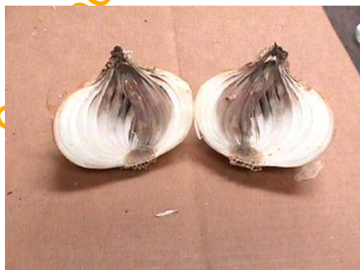
Figure 9 — Reddish brown discoloration of neck rot onion scales caused by Botrytis neck rot

Management options: Harvesting healthy mature onions with a well-dried neck will greatly reduce Botrytis neck rot incidence in storage. Avoid over-fertilization and high plant populations, which lead to delayed maturity and reduced air movement through the canopy, respectively. Curing onions with forced air heated to 98 degrees F will cause the outer scales to dry down and become barriers to Botrytis infection. Storing onions near 34 degrees F at approximately 70 percent relative humidity reduces growth and spread of neck rot. Sanitation through deep soil turning and destroying cull piles helps reduce the amount of Botrytis allii inoculum in production fields. A combination of boscolid and pyraclostrobin, as well as these products individually, have been shown to give good control of Botrytis neck rot. Using any fungicide should be integrated into a complete system of disease control. In addition, follow label direction for use.