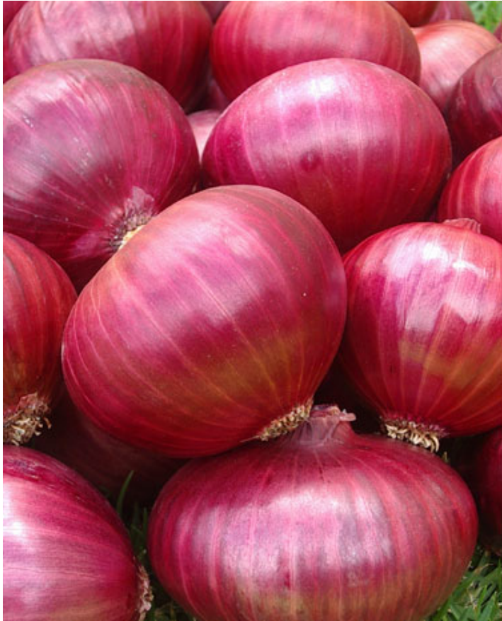
Red Creole Onions