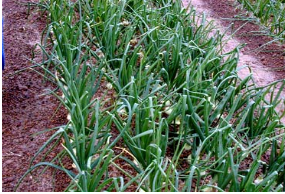
Figure B.2 — Typical onion field

Transplants are field set on slightly raised beds approximately 1.2 m wide. Beds are 6 feet centre to centre. These beds or panels, as they are sometimes called, will have four rows of onions spaced 30-35 cm apart and a spacing of 11 cm - 15 cm within the row (Figure 2). The spacing is determined by peg spacing on a pegger used to place holes in the bed surface 2.5 cm – 5 cm deep (Figure 3). Transplants are hand set in each hole.