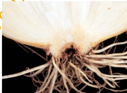
Figure B.7 — Onion basal plate infected with Fusarium basal rot

Symptoms: Symptoms may be observed in the field as yellowing leaf tips that later become necrotic. This yellowing and/or necrosis may progress towards the base of infected plants. Sometimes leaves of infected plants exhibit curling or curving. Infected bulbs, when cut vertically, will show a brown discoloration in the basal plate (Figure B.7). This discoloration moves up into the bulb from the base. In advanced infections, pitting and decay of the basal plate, rotten sloughed-off roots, and white, fluffy mycelium are all characteristic symptoms and signs of Fusarium basal rot. Sometimes, infected bulbs may not show symptoms in the field but will rot in storage.