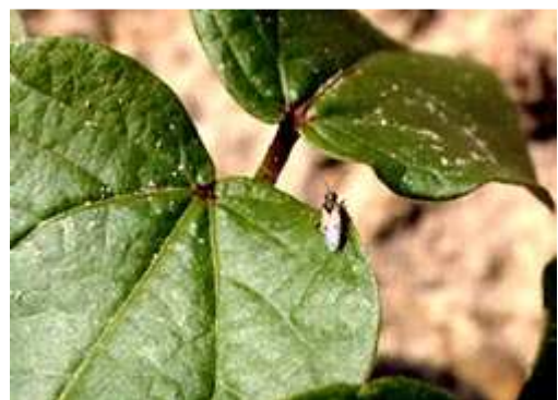
Figure A.36 — False chinch bug

The false chinch bug, Nysius raphanus , is a fragile sucking bug that is primarily a pest on turnip and mustard. False chinch bugs may infest fields in large numbers. They damage plants by feeding on the veins on the undersides of the leaves. They inject enzymes during the feeding process, causing a green wilting of the leaf margins. This condition is variable; no information is available on how many bugs cause wilting. Therefore, decisions on control are arbitrary, but heavy infestations should not be left uncontrolled.