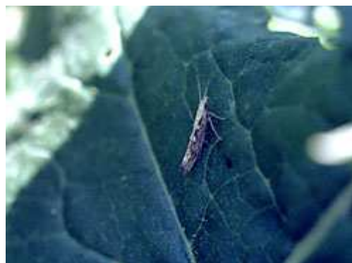
Figure A.12 — Diamondback moth caterpillar (adult)

Suppression of DBM populations with preventive treatments is the most efficient control method. Preventive treatments with biological compounds should be made on a five-day interval. A seven-day interval may be used if no worms are found, especially during cool winter weather. Cleanup sprays may be necessary periodically. Heavy rain showers may reduce populations dramatically. Monitor crops two to three times per week and make decisions on changes in control strategies. Note: Transplant beds should be kept free of infestation.