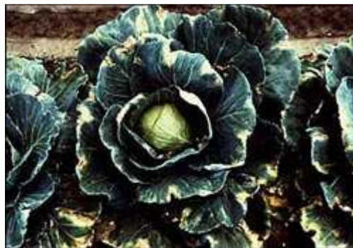
Figure A.1 — Black-rot

Black-rot is caused by the bacterium Xanthomonas campestris pv. campestris . The bacterium attacks many species of the mustard family. Among these are cabbage, collard, kale, mustard and turnip. Plants may be affected at any stage of growth. This disease is seedborne and is often introduced by contaminated seeds or infected transplants. In some cases, the crop may be destroyed. In the field, the disease is easily recognized by the presence of large yellow to yellow-orange V-shaped lesions extending inward from the margin of the leaf.