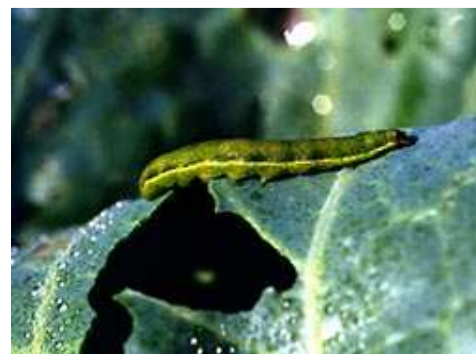
Figure A.23 — Beet armyworm

The beet armyworm, Spodoptera exigua , may be a pest to fall plantings of cabbage, collard, kale, mustard and turnip. Heavy populations that have increased on other crops move to greens crops when food sources become scarce. Diseases during this period often suppress populations below an economic level, but occasionally the beet armyworm can devastate a crop. The beet armyworm is one of the most difficult caterpillars to control. It is naturally resistant to most commonly used insecticides. If it develops into very large populations, control might not be regained. The moth lays masses of eggs on the undersides of leaves. The mass may have up to 150 eggs and is covered with scales off the moth's body, giving the mass a cottony appearance.