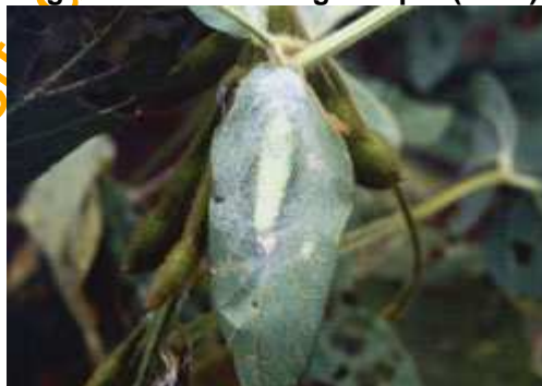
Figure A.18 — Cabbage looper (pupa)