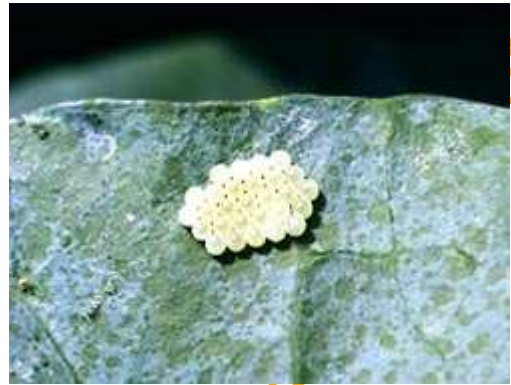
Figure A.33 — Stink bug (eggs)

Several species of stink bugs attack leafy greens. One of the most common species is the Southern green stink bug, Nezara viridula . Stink bugs commonly infest turnip and mustard more than cabbage and other leafy greens. Stink bugs pierce the plant cell and suck out plant sap. The most common problem with stink bug infestations is that they are a contaminant in processed greens. Control stink bugs when wilting is observed from feeding or when they are found above the accepted threshold for processing.