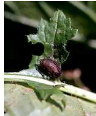
Figure A.40 — Yellow-margined leaf beetle (pupa)