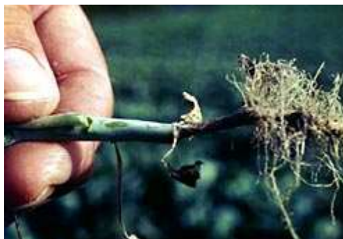
Figure A.2 — Wirestem, bottom rot and head rot

Wirestem, bottom rot and head rot are caused by Rhizoctonia solani . This fungus also is a common cause of damping-off. Wirestem is normally more serious in transplant beds; however, it can be a serious problem after plants are transplanted to the field. Cabbage, collard and kale planted in early fall are more vulnerable to Rhizoctonia injury than spring plantings. Wirestem infected plants are first infected near the soil surface. The initial infection site may be as small as a pinpoint or extend an inch up the stems.