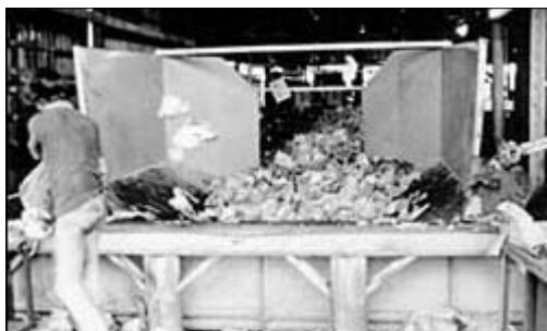
Figure A.46 — Pitching cabbage into field wagons or packing line bins causes splitting of heads.

burst when subjected to impact damage. Leaves of leafy greens are crushed if they are overpacked into field boxes. If not used properly, cutting tools will puncture leaves. Any cuts or breaks in the leaves or heads will cause excessive wilting and provide avenues for decay pathogens.