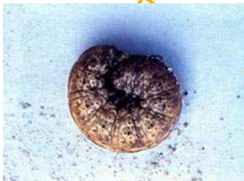
Figure A.25 — Cutworm

The granulate cutworm, Feltia subterranea , is the most common species in cabbage and leafy greens production areas. Cutworms may survive long times in the larval stage, so large larvae may be present at the time of planting, especially when planting is made into previous crop residue. Cutworms are recognizable by their greasy dingy grey colour and C-shaped posture when at rest. Cutworms feed at night, causing damage to stems and foliage, and retreat into the soil during the day. Treatments for cutworms should be anticipated by inspecting the soil during land preparation so insecticides can be incorporated at planting.