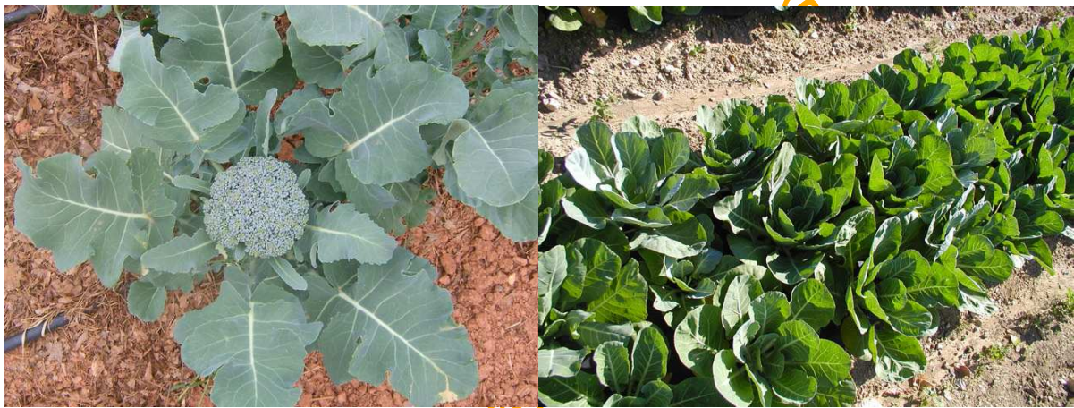
Growing broccoli greens