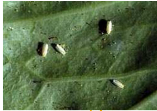
Figure A.37 — Silverleaf whitefly

The silverleaf whitefly, Bemisia argentifolii , is a sporadic pest of cabbage and leafy greens. The adult is smaller than a gnat and is bright white with a yellow head and thoracic region. It is mothlike in appearance and feeds on the undersides of leaves, where it also lays eggs. The larvae hatch and become sessile on the underside of the leaf. The adults fly rapidly from the plant when disturbed. Heavy feeding can result in small yellow spots on the foliage of the tender leafy greens. When on cabbage or collard, the whitefly is more a contaminant than an injurious pest. Control for whiteflies is not recommended unless populations in the area are becoming excessively large or honeydew and/or sooty mould is developing on the foliage. Whitefly control is strictly a judgment decision without threshold guidelines.