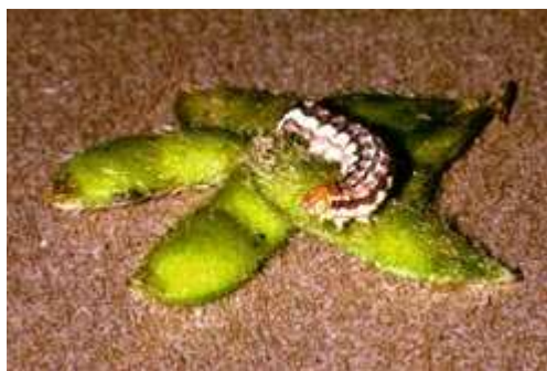
Figure A.24 — Corn earworm

Make treatments when small larvae are observed on 4 percent to 5 percent of the plants or if large larvae are found on 2 percent or more on the plants.