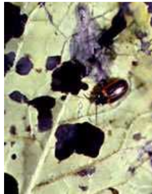
Figure A.39 — Yellow-margined leaf beetle (adult)

The yellow-margined leaf beetle, Microtheca ochroloma , is a small beetle that infests turnip and mustard, especially at field margins. The beetle is black with dirty, yellow-margined wing covers. The larvae are black and alligator-shaped with three pairs of stocky legs. The larvae and adults feed all over the leaves, leaving them with a laced appearance. The pupae may be found in white, round and loosely woven cocoons near the crown of the plants. Initiate controls when larvae and adults are causing noticeable damage and are still present in the field.