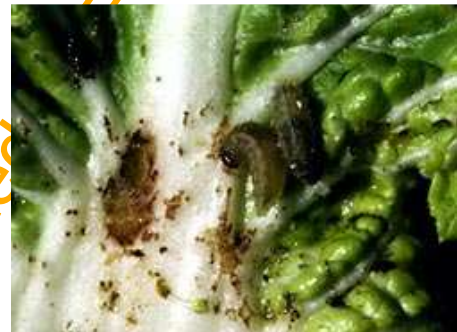
Figure A.38 — Vegetable weevil (larvae)

The vegetable weevil, Listroderes costirostris , may be a pest of seedling cabbage and leafy greens, especially under cool growing conditions. Adults are about 6.35 mm to 10 mm long with a stout snout. They are brownish-gray with two nondescript whitish marks on the wing covers. The larvae are white legless grubs. The adult weevil and grub feed directly on the foliage and stems of greens. They can cause significant stand reductions on young plantings. If weevils or grubs are found feeding, apply treatments if more than 5 percent of the stand is being damaged.