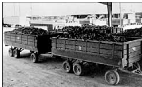
Figure A.47 — Harvested greens should be shaded from direct sunlight to preserve quality.

Cabbage and other greens wilt quickly when there is a delay in removing them from the sun. Leafy greens should be harvested during the coolest part of the day to minimize shrivelling and field heat accumulation. If delays occur during packing, shade greens from direct sunlight.