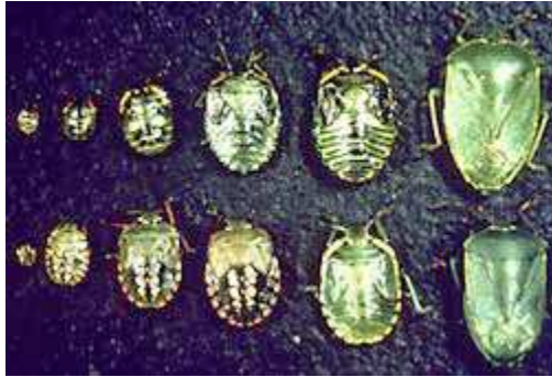
Figure A.34 — Stink bugs (nymphs and adults)