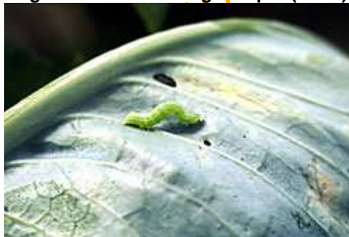
Figure A.17 — Cabbage looper (larva)