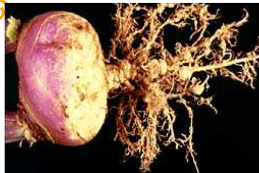
Figure A.9 — Root-knot nematode

Root-knot nematode is the only nematode of economic importance that affects crucifers. All species of root-knot are considered pests of crucifers. Cabbage, turnip, mustard and spinach are the main crops affected. Stunted growth and chlorosis are the above-ground symptoms. Classic galling of the root system is key for diagnosing root-knot nematode damage. Rotation and chemical treatment are the control practices.