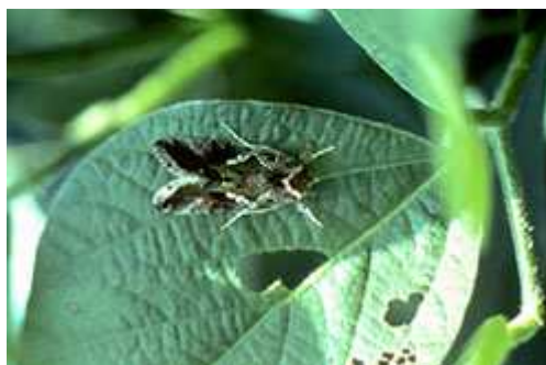
Figure A.16 — Cabbage looper (adult)

Controls should be initiated at the first signs of moth activity, whether this is eggs or young larvae. Monitoring the crop two or three times per week helps in making control decisions.