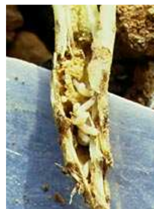
Figure A.26 — Seedcorn maggots

The seedcorn maggot, Delia platura , is a secondary pest that attacks many types of plants. The maggot is a general feeder that is attracted to decaying organic matter. When seedlings are placed under stress, they are most subject to attack by the seedcorn maggot. This occurs most often during the cooler months of planting when transplants are developing slowly. The immature stage is the maggot, which eventually becomes a small housefly-like adult. The maggot damages the plant by entering the roots and stem. Usually, the plant is weakened beyond recovery. Many plants can be killed. The most effective control is to anticipate the conditions that create a favourable environment for maggot attacks and apply the preventive, soil-applied insecticides. Cabbage and collard are the most susceptible to attack.