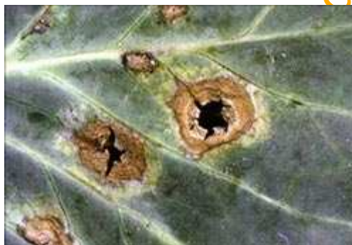
Figure A.3 — Alternaria leafspot

Alternaria leafspot, caused by the fungus Alternaria brassicae , may cause severe damage if left uncontrolled. The first symptom is a small dark spot on the leaf surface. As the spot enlarges, concentric rings, which are common to this disease, develop. Blight spots enlarge progressively and can defoliate a plant if left uncontrolled. Alternaria leafspot is best controlled by applying a fungicide on a schedule throughout the entire growing season.