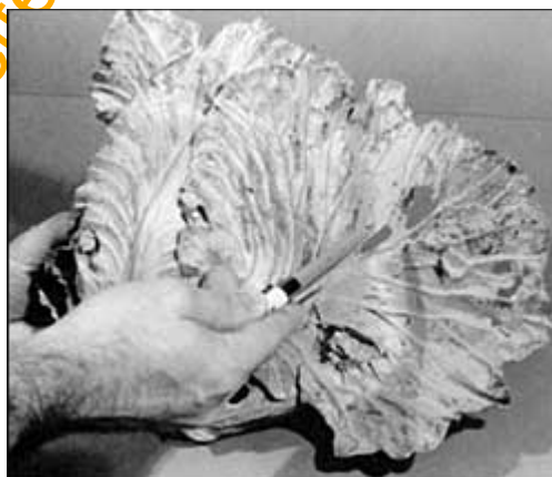
Figure A.45 — Damaged or diseased leaves should be removed before field packing.

Many leafy greens (including cabbage, collard, kale, mustard and turnip) are cut by hand and packed directly in the field for the fresh market. Necessary trimming to remove any yellowed, brownish or damaged leaves should be done as the plants are picked and before they are tied into bunches and placed into containers. In addition, cabbage may be cut by hand, loaded into a bulk container such as a field wagon and hauled to a packing shed for trimming, grading and packaging. During cabbage harvest, cut stems so that they do not extend more than 12.7 mm beyond the point of attachment of the outmost leaves. Heads may be damaged by excessively long, protruding stems. Bunch collards according to uniform size. Coarse, tough stems of plants should not be packed. Harvest leaves of turnip, mustard and kale when tender by feel, and avoid those showing tough stems.