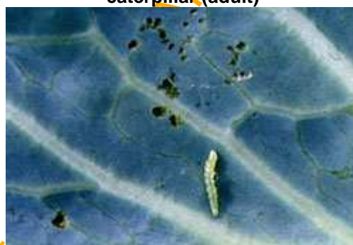
Figure A.13 — Diamondback moth caterpillar (young larva)