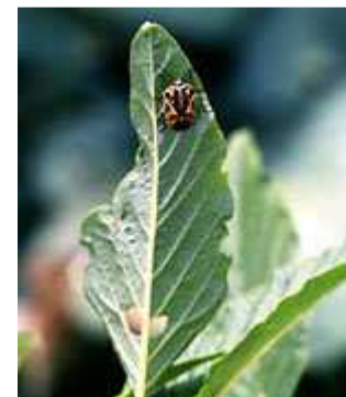
Figure A.32 — Harlequin bug (adult)