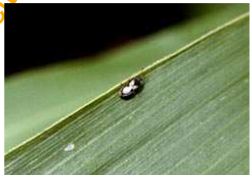
Figure A.35 — Chinch bug

The chinch bug, Blissus leucopterus , may infest turnip and mustard crops, especially when they are planted near corn or small grains. Chinch bugs are small sucking bugs that prefer to feed on grass crops but may migrate to vegetables when these hosts become unsuitable. Even though the adults have wings, they do not fly. Chinch bugs are difficult to control, so early scouting for chinch bugs migrating from nearby sources is important. Initiate controls if a large migrating population is detected.