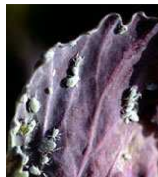
Figure A.27 — Cabbage aphids

The cabbage aphid, Brevicoryne brassicae , is common. Its appearance differs from other species, with a powdery, waxy covering over its body. Its body is greyish-green. This aphid feeds primarily on cabbage, collard and kale, and seldom feeds on mustard or turnip. The cabbage aphid is difficult to