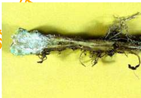
Figure A.6 — Cabbage yellows

Cabbage yellows is caused by Fusarium oxysporum f.sp. conglutinans . The cabbage strain severely attacks many varieties of kale, cabbage and collard, and moderately affects turnip. The disease is often confused with black rot because of the similar symptoms. Both diseases cause leaf drop, curving stalks and the formation of buds on leafless stems. Yellows is more likely to produce a curve in the midrib or cause the leaf to grow on only one side. Fusarium can live for several years in the soil without being associated with any plant parts. After the pathogen becomes established, it spreads by rain and by equipment moving from one field to another. The fungus enters root hairs, and spores are produced inside and outside of affected stems. Most currently recommended varieties are resistant to yellows.