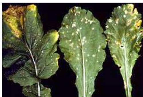
Figure A.7 — Cercospora leafspot (left), Cercospora leafspot (center) and anthracnose

White spot overwinters on such plants as turnip, mustard, collard, cabbage and kale. The fungus