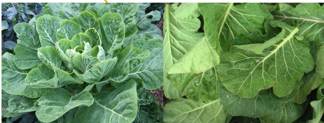
Quality collard greens

10.2 The produce should comply with any microbiological criteria established in accordance with CAC/GL 21.