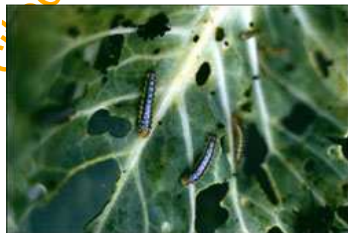
Figure A.22 — Cross-striped cabbageworm

The larvae may be slightly longer than 19 mm and have black and white transverse stripes down the back. Below the transverse stripes on each side is a black and yellow stripe along the length of the body. Initiate controls when larvae are observed.