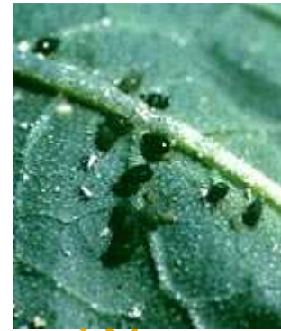
Figure A.28 — Green peach aphids

The green peach aphid, Myzus persicae , feeds on many vegetable crops and row crops. The wingless types are yellowish-green, green or pink. The winged forms are usually darker. The green peach aphid is most destructive to turnip, mustard, kale and collard but can cause problems in cabbage. Control may be difficult, but can be accomplished with thorough coverage of insecticide sprays. Insecticide controls on seedling stage greens should be avoided until parasites and diseases are given a chance to suppress the population.