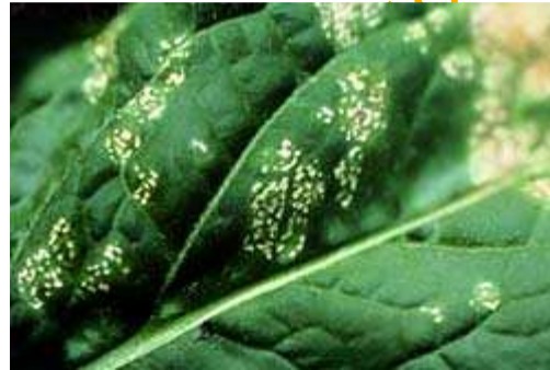
Figure A.8 — White rust of spinach

White rust is most often seen on spinach and is caused by Albugo sp. White rust affects other crucifers. It has been observed on mustard in a few instances. The disease overwinters by means of oospores. In perennial hosts, such as horseradish, it persists in crowns and roots. Secondary spread is by conidia (spores), which are carried by air currents. Moisture on the host surface is essential for germination. White rust is recognized by a white growth, usually on the underside of the leaves. White rust is controlled by soil and foliar applied fungicides.