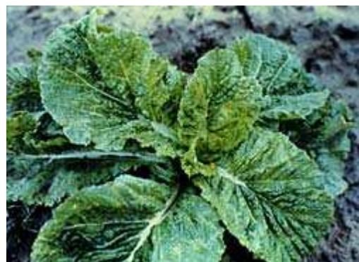
Figure A.10 — Viruses

Cabbage mosaic causes black specking of cabbage