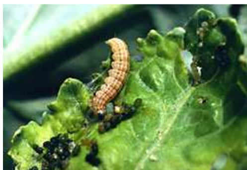
Figure A.19 — Cabbage webworm

Control for the webworm should be initiated at the first signs of an infestation. Some of the same insecticides used against the cabbage looper give good control if coverage in the bud area is excellent.