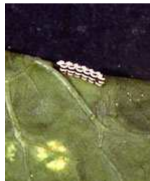
Figure A.31 — Harlequin bug (eggs)

The harlequin bug, Murgantia histrionica , is rarely a pest of commercial plantings of kale, mustard or turnip. It is more likely to be a problem in cabbage and collard. The harlequin bug is a brightly marked shield-shaped bug that has piercing, sucking mouthparts. It feeds on the veins of leaves, causing the leaf to wilt. Their eggs are barrel-shaped and laid in clusters on the leaves. Eggs are white with two black bands around them. Initiate controls if one bug per 10 plants is found.