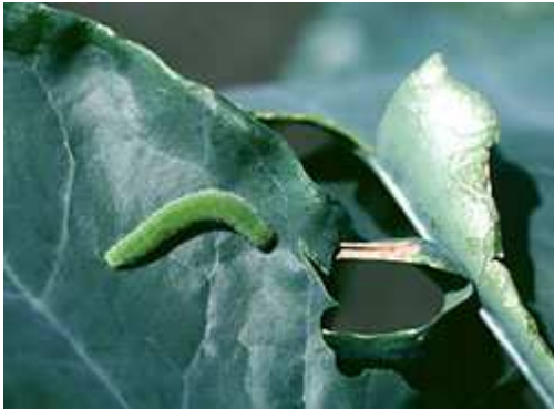
Figure A.21 — Imported cabbage worm (larva)

The imported cabbageworm, Pieris rapae , is rarely an economic pest on cabbage and leafy greens if controls for other worms are being applied. The adult is a common butterfly that lays eggs singly on the leaf surface. The larvae are green and have a velvety appearance. Larvae have a narrow, light yellow stripe down the back. Initiate controls when a buildup of larvae occurs.