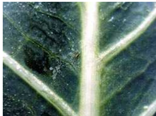
Figure A.30 — Thrips

Because cabbage is susceptible to tomato spotted wilt virus (TSWV), thrips may become a more important pest in the future. Occasionally, thrips cause a mechanical, "buckskin-type" injury. Controls are not recommended unless heavy populations are observed.