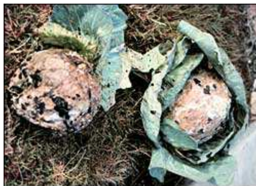
Figure A.5 — Sclerotinia sclerotiorum

Sclerotinia sclerotiorum is becoming more prevalent in cabbage fields as well as transplant beds and greenhouses. Recently this disease has also been identified on turnip, mustard and kale. The disease usually begins on the lower stem, causing a watery soft rot followed by white, cottonlike growth. Black sclerotia, overwintering structures that give rise to the spore-producing apothecia, develop later. The disease is favored by cool, wet weather, which may result in a massive steamlike cloud of spores being spread throughout an area. The disease can infect cabbage from the seedling stage to maturity.