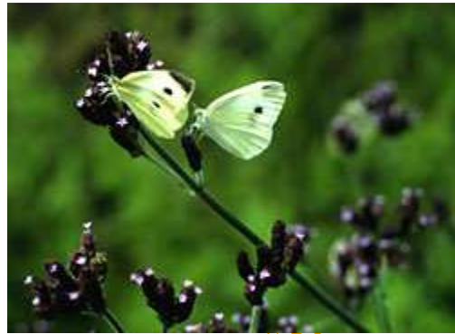
Figure A.20 — Imported cabbage worm (adult)