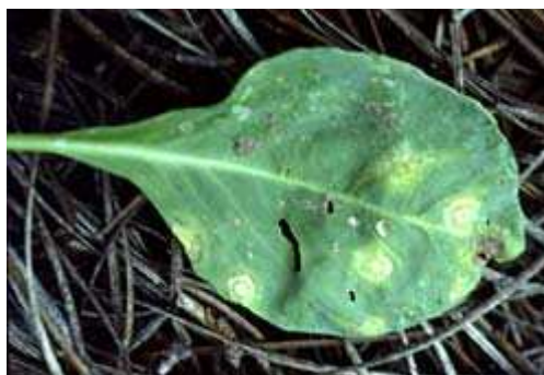
Figure A.11 — Viruses

Tomato spotted wilt virus (TSWV) can infect cabbage at any stage of growth. The virus is transmitted by thrips.