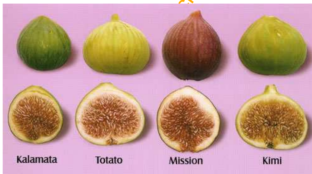
Varieties of figs

10.2 The produce should comply with any microbiological criteria established in accordance with CAC/GL 21.