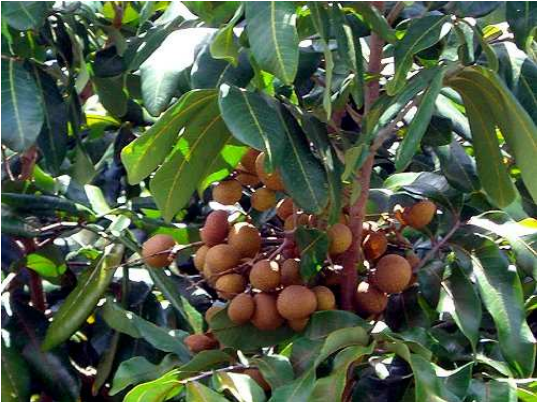
Longans ripening in farm