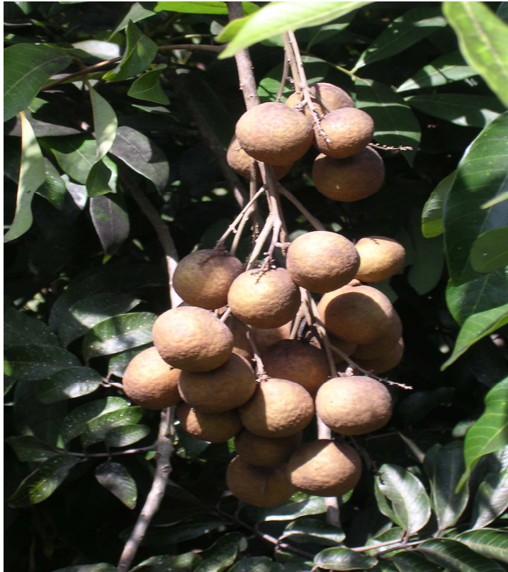
Longans ready for harvesting