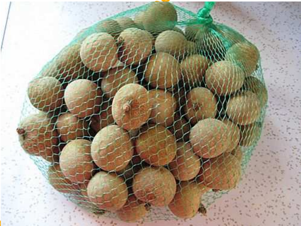
Longans in net package