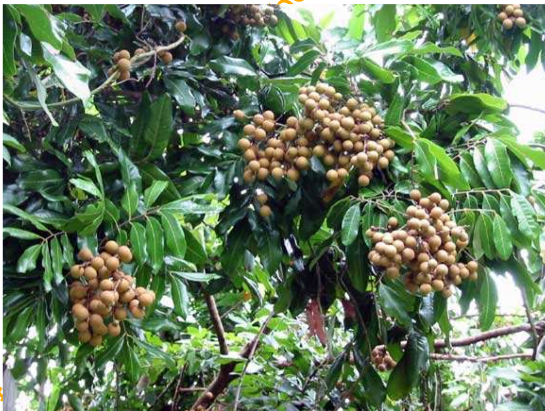
Longans ripening in farm